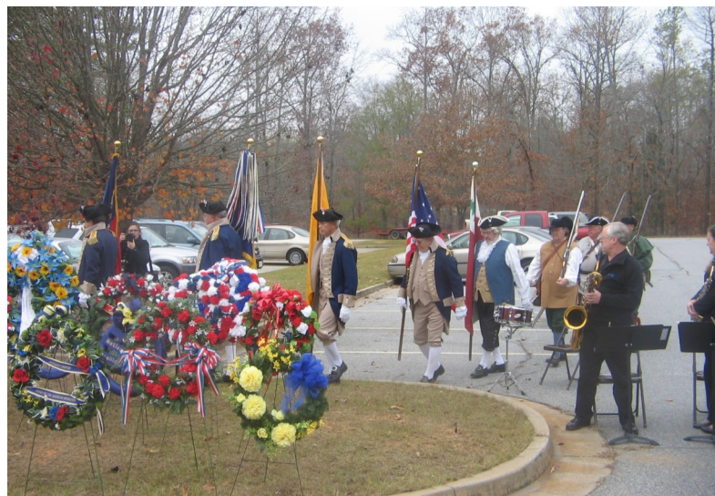
Georgia Society Color Guard