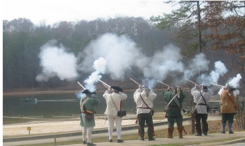
Col. Elijah Clarke Militia Fires a Musket Salute

The war in the South continued, finally terminating with the Patriot victory at Yorktown, Virginia.